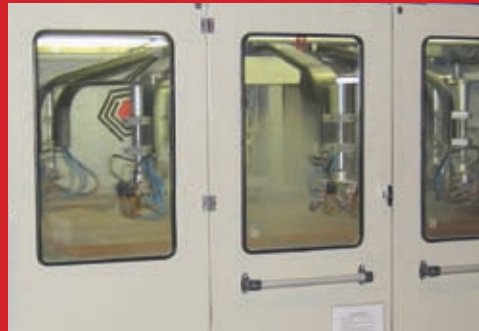
Our automated equipment provides a consistent coat of paint or stain, ensuring an ultra smooth finish.

We take pride in what we do and what we deliver to your construction site. Every order is handled with care and completed to your exact specifications. For prefinishing, our trained personnel use automated, state-of-the-art equipment. This ensures that your doors will maintain their beautiful appearance for years to come. When your order is fulfilled, each door is securely packaged and accurately marked for on-time delivery. Please note that all Waudena™ doors are loaded onto steel racks that can be easily loaded and unloaded with a forklift.