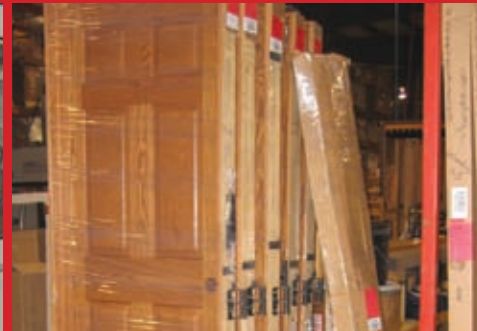
All doors are securely packaged and protected until they reach your job site.